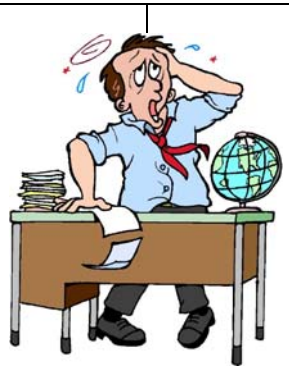
How Are You Managing Stress?

All articles, quotes, and material in this newsletter are copyrighted. © No part can be reproduced in any form without specific written consent from copyright holder(s). All rights reserved worldwide. ©SA