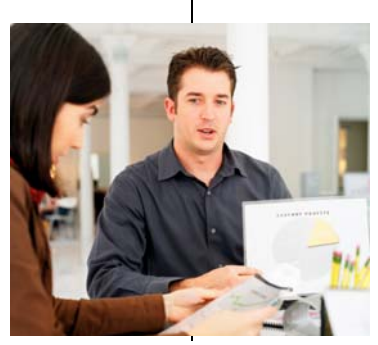
Why are some people difficult to work with?

All articles, quotes, and material in this newsletter are copyrighted. © No part can be reproduced in any form without specific written consent from copyright holder(s). All rights reserved worldwide.